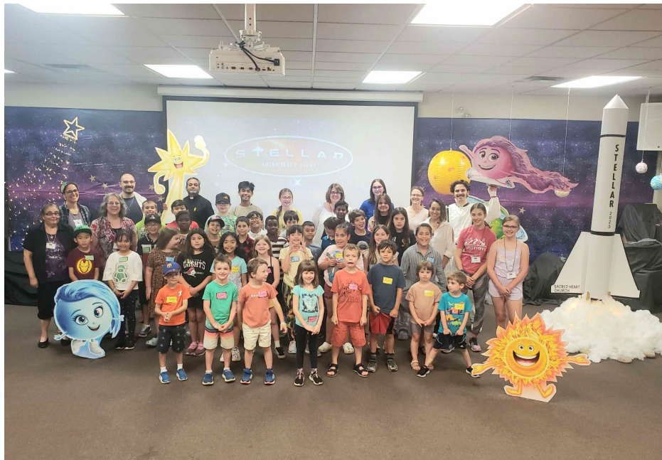
Figure 4: A group of children attended the Stellar Vacation Bible School in Terrace in July, 2023